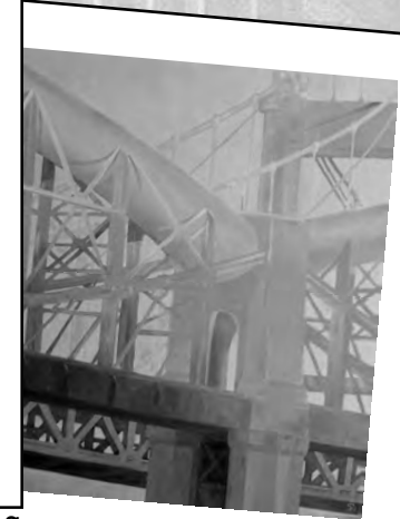
The Summer Evening Light