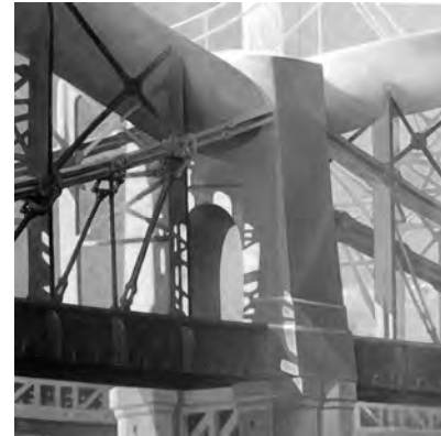
The Mid-summer Light