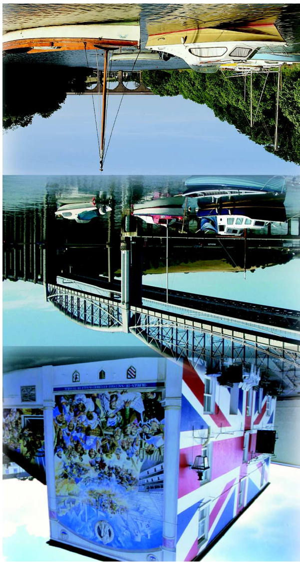
Saltash was a borough town When Plymouth was a fuzzy town...